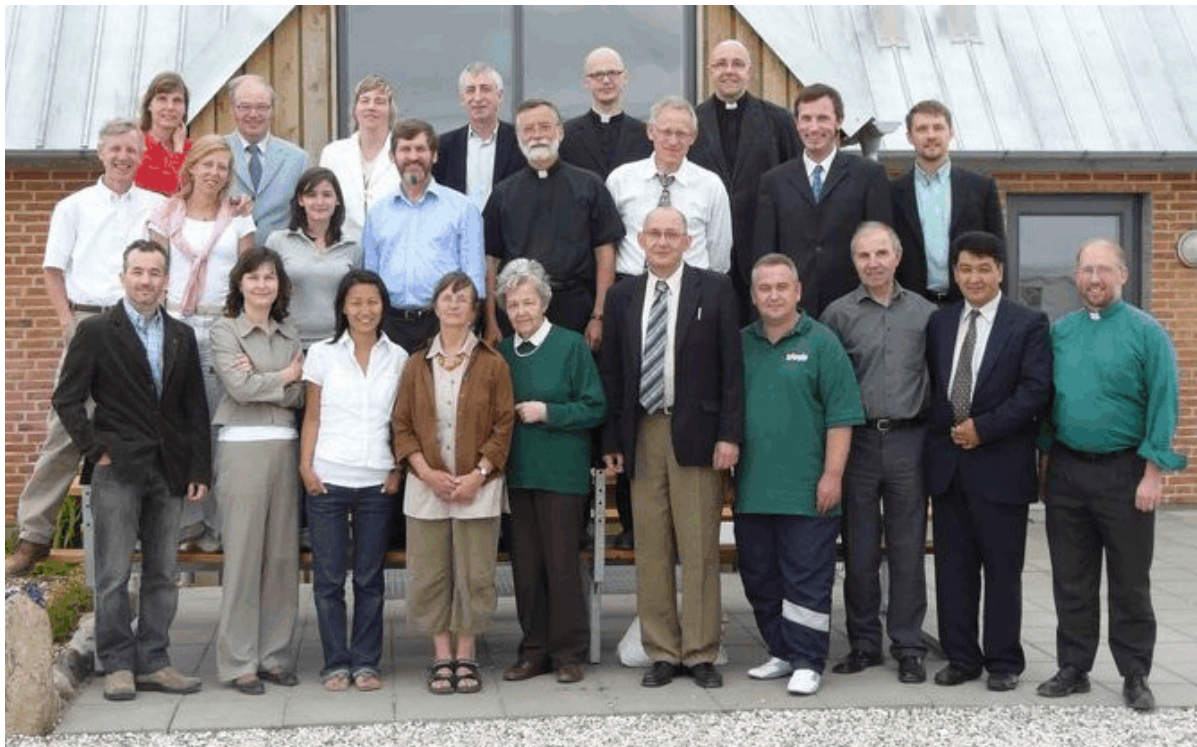
Participants of the 20 th European Lutheran Conference in Denmark