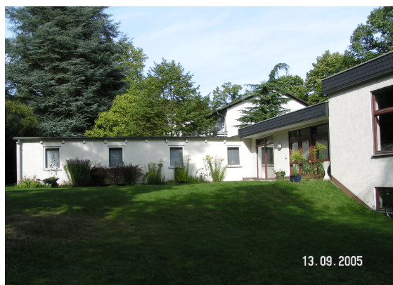
Partical view of LTS Campus in Oberursel

selk-news - On 15 Juni 2008, the Lutheran Theological Seminary (LTS) of the German Independent Evangelical Lutheran Church (SELK) celebrated its 60 th anniversary in Oberursel with many visitors.