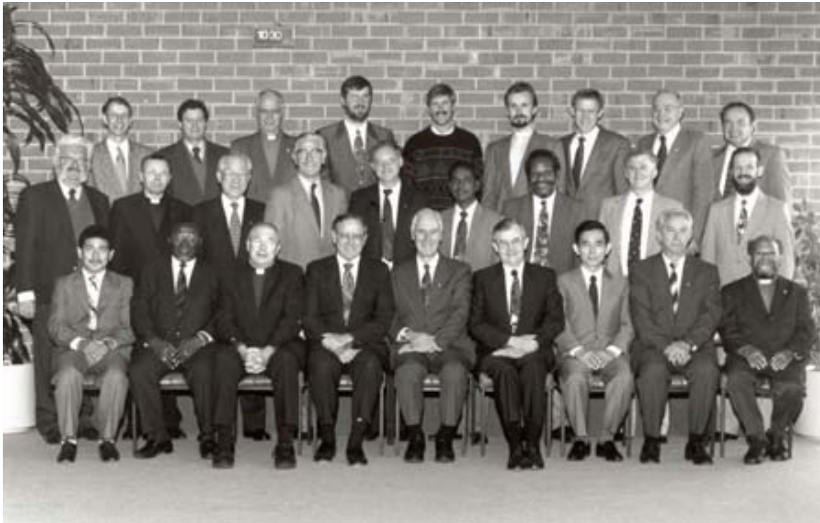
Participants of the 16 th ILC Conference in Adelaide, Australia