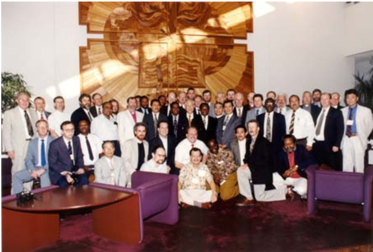
Participants of the ILC Conference 1997 in St. Louis, Missouri, USA