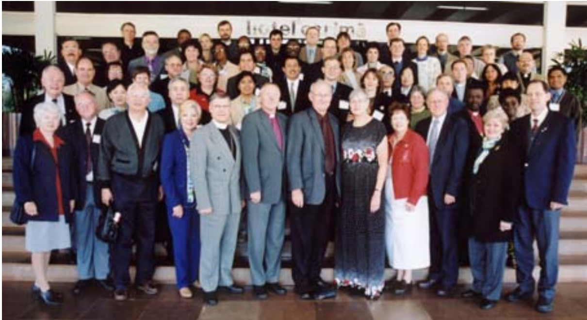
Participants of the 2003 ILC Conference in Foz do Iquaçú, Brazil