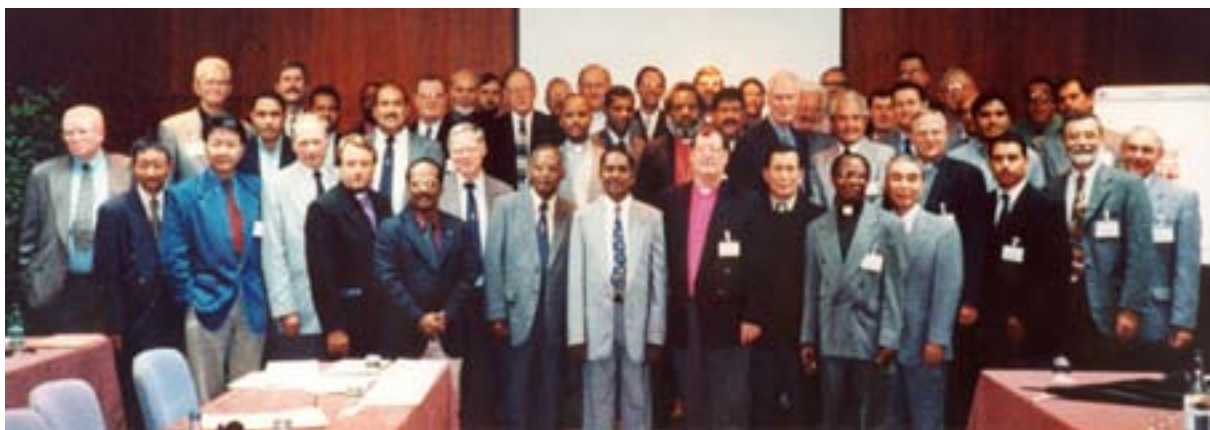
Participants of the ILC Conference 1999 in Cambridge, England, UK