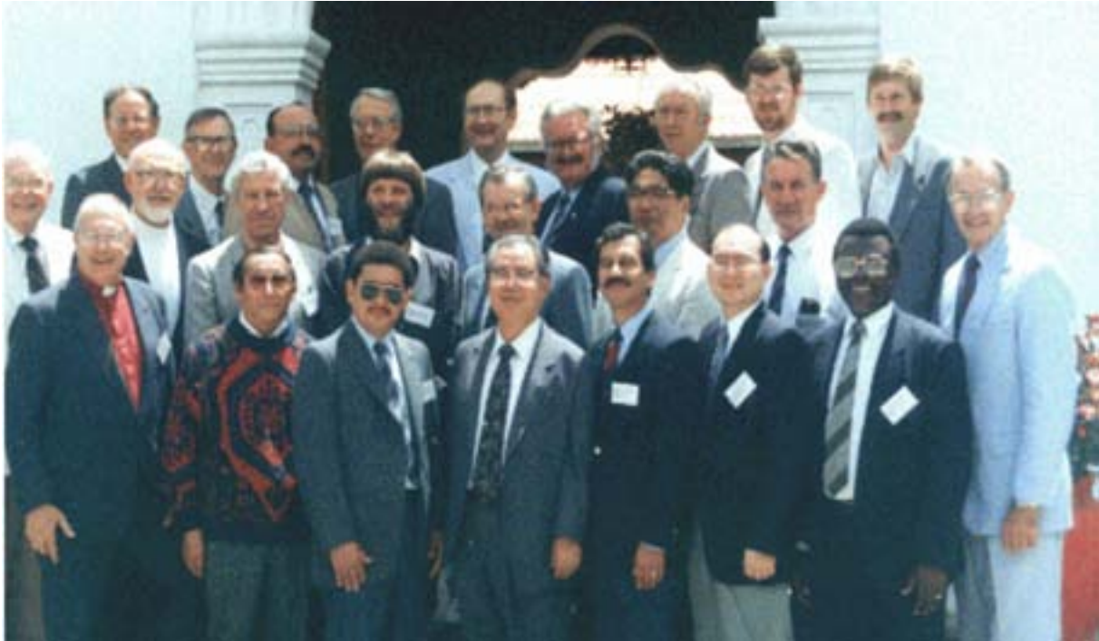
Participants of the 1993 Founding Conference of the ILC in Antigua, Guatemala